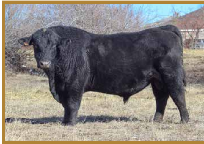
CSG SURE FIRE 45G

Lel 48 CSG SURE FIRE 7N 1/27/2025 53%GV 47%AN BLACK/POLLED REG#AMGV1648583