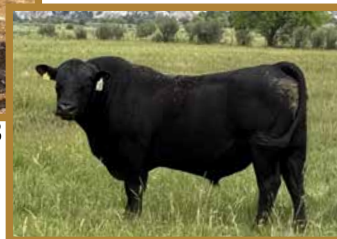
SASQUATCH 3113- 2 YEAR OLD