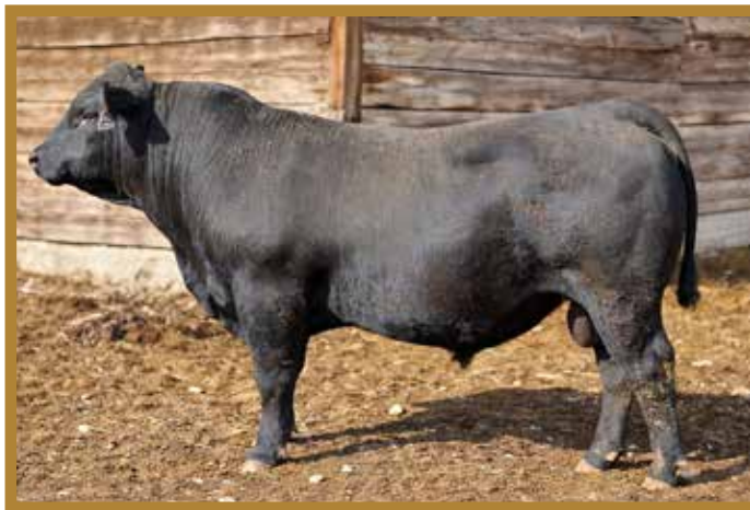
DEEP CREEK SASQUATCH, SIRE TO LOTS 21-30