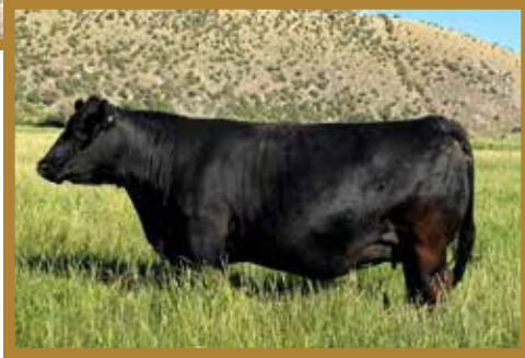
DCFS POST ROCK BIRD DAM TO LOT 6

121N a craftsman son out 26H from the Twyla cow family, one of the most fertile cow families in our herd. He has good balanced numbers from birth to yearling.