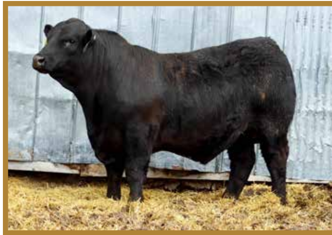
DCSF POST ROCK BLK BAL, SIRE TO 16-20