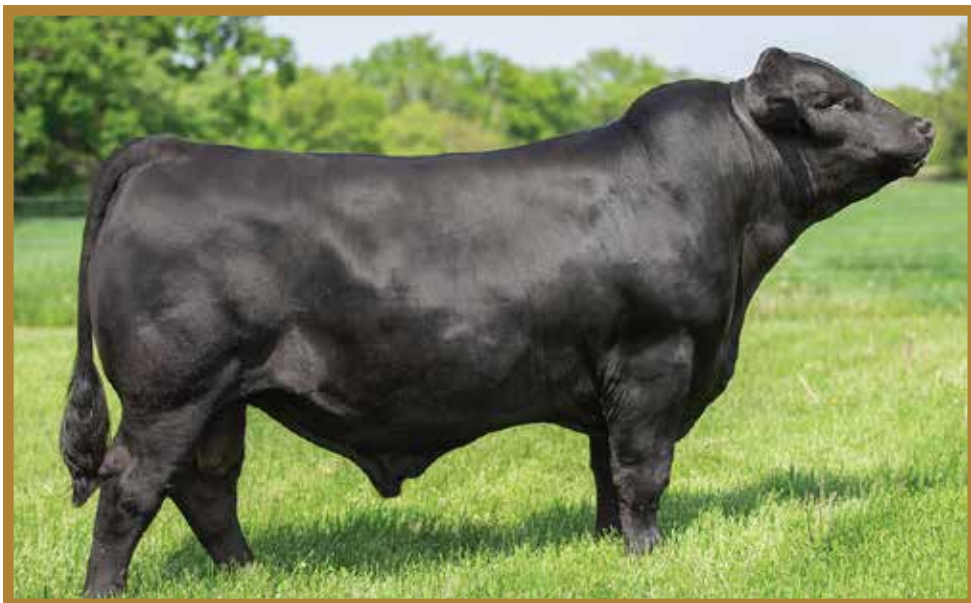
ALL AMERICAN SIRE TO LOTS 2,3,and 4

131N is a stud of a bull! He is very well balanced with loads of muscle and red meat. His mother, Tulip 205A2, is a tremendous cow that is 13 years old. She still has a good udder and milks well. 131N has a weaning weight of 755 and yearling weight of 1384. He is sired by the great All American J109 that was one of the heaviest used purebred Gelbvieh bulls in the USA and Canada. He gained 3.9 on test.