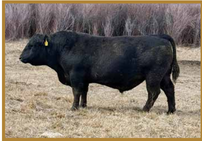
CSG GALACTIC 140K