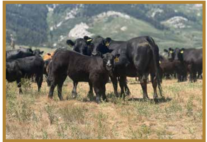
LOT 28 AS A CALF