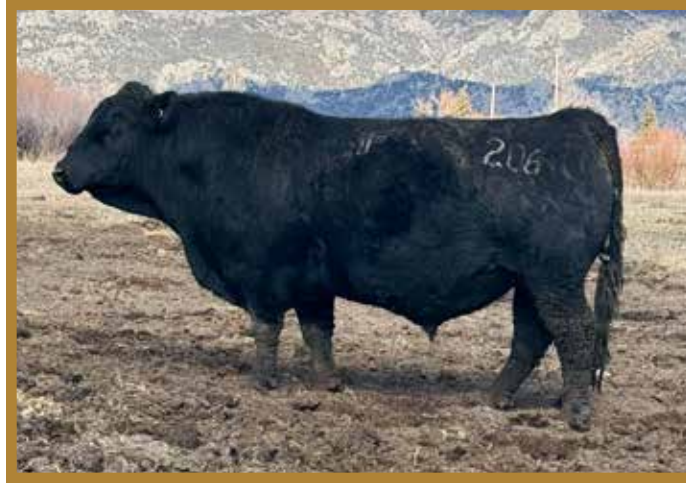
TAYD 321A SAND TRAP 206K