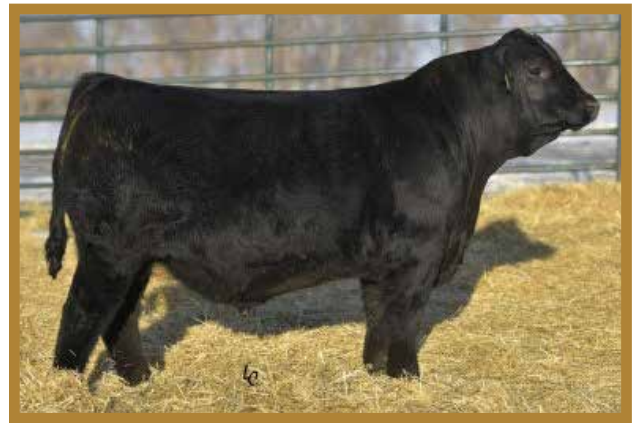
EGL GAME CHANGER, SIRE TO LOT 5

20N Is sired by the great ELG GAME CHANGER D136. He carries a lot of red meat in an eye 30N 30N this is a nice son of our 107L8 bull. He is siring the right kind. 30N's 11-year-old mother raised him in dry range conditions and weaned him at 712 pounds. 4.3