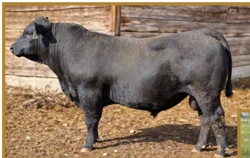
Sire to Lot 1 Deep Creek Sasquatch 3113

32N may be the best bull we have raised. He is sired by our herd bull, SASQUATCH 3113, and out of a 3-year-old cow that is picture perfect, with a great udder, and obviously milks well. 32N is very sound, with good bone on excellent feet and legs. He is thick, deep-bodied and full of red meat. He will complement any herd as he sports a 744 ADJ. 205-day weight and 1379 ADJ. yearling weight. He gained an impressive 5.5 pounds a day on test, on a ration that is geared for 3.25 ADG. He is also one of the calmest bulls in the pen.